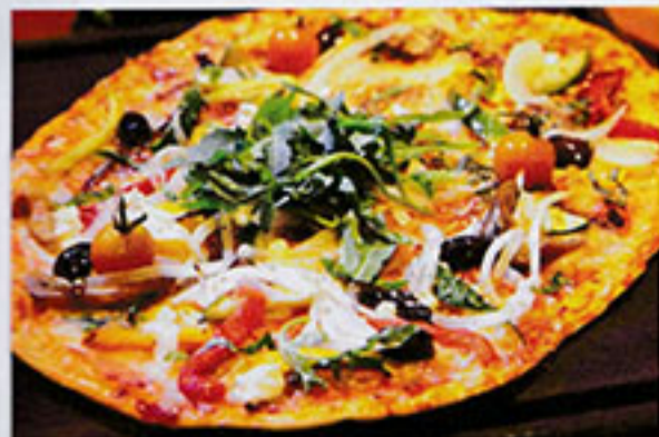
Sharing plates at The Conservatory